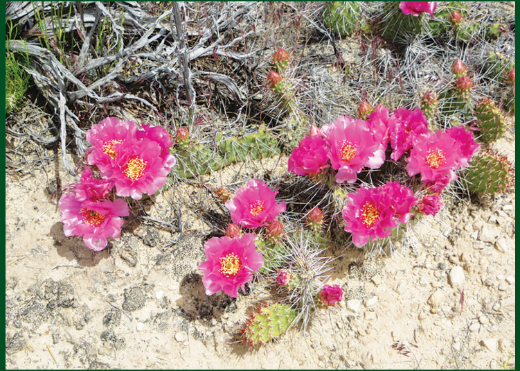
Opuntia

Colorado State University Extension is an equal opportunity provider. | Colorado State University Extension es un proveedor que ofrece igualdad de oportunidades.