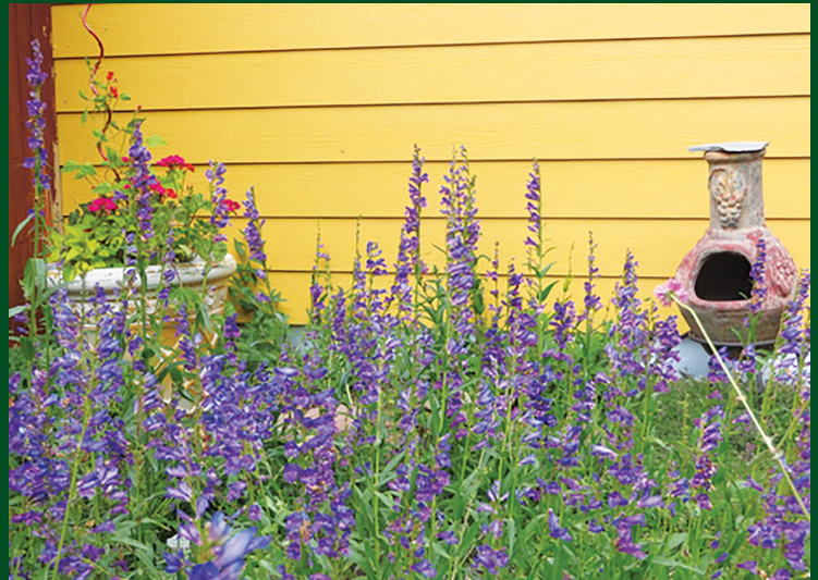
Rocky Mountain Penstemon