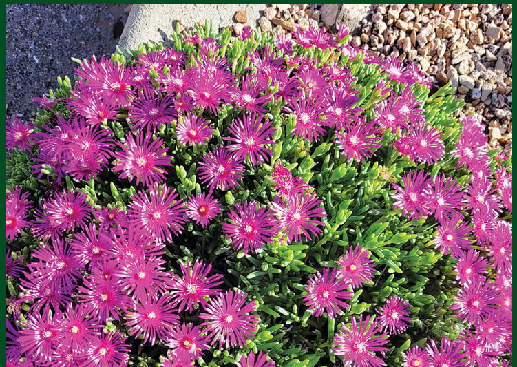
Purple Ice Plant