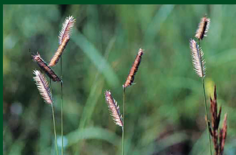
Blue Grama Grass