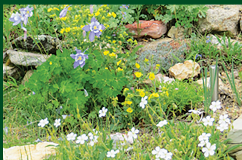
Geranium and Rocky Mountain Columbine