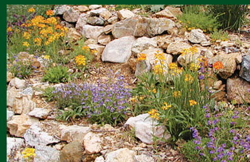
Wallflowers and Blue Mist Penstemons