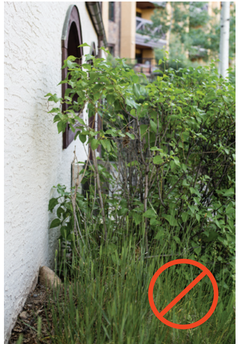
Shrubs should be kept at least 5' from structure