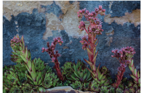
Hens and Chicks