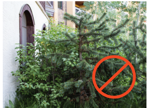
Example of unsafe separation between structure and vegetation