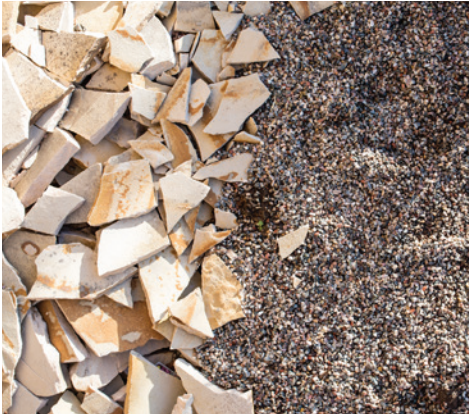
Shale rock and decomposed granite