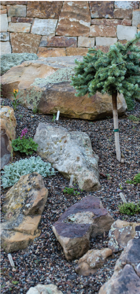
Example of non-combustible landscaping