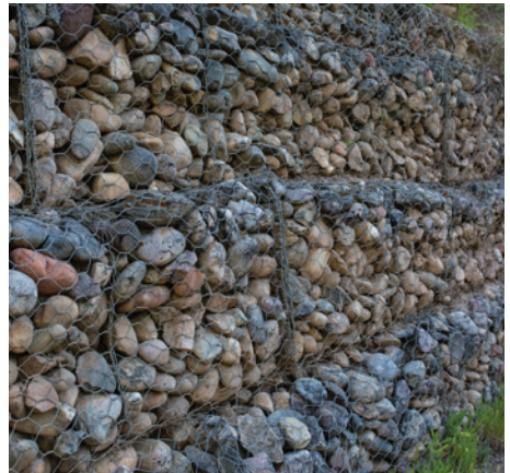
Gabion rock wall