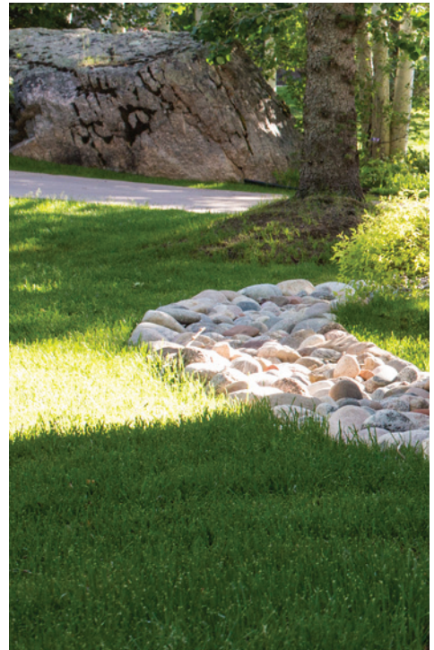
Well maintained grass broken up with non-combustible river rock feature