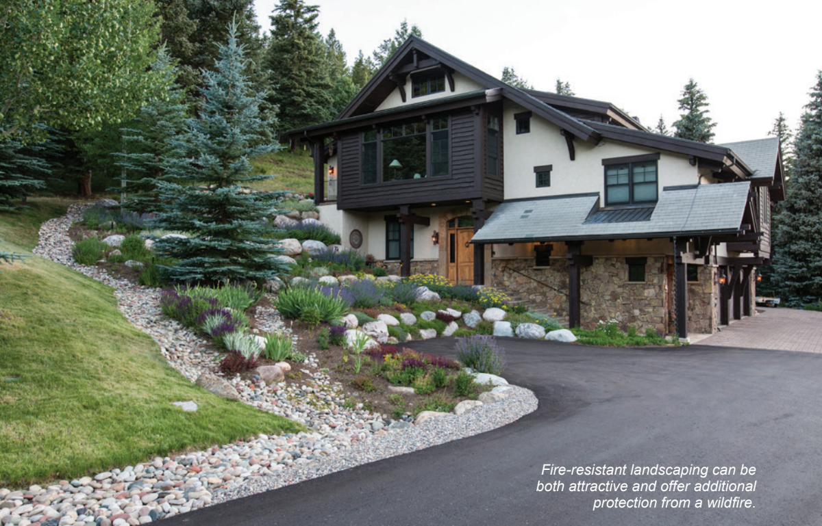
Fire-resistant landscaping can be both attractive and offer additional protection from a wildfire.