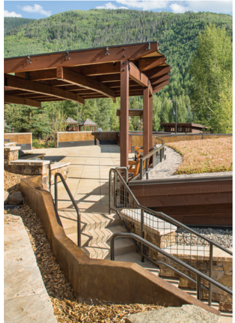
Example of good non-combustible landscaping