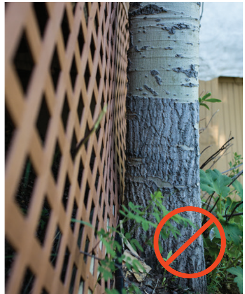
Example of tree too close to structure