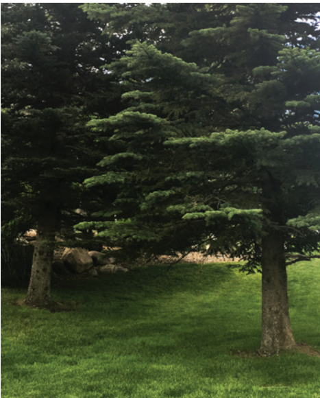
Example of safe ground clearance