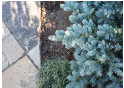
Example of proper non-combustible surface separation