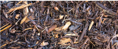
Organic shredded bark mulch